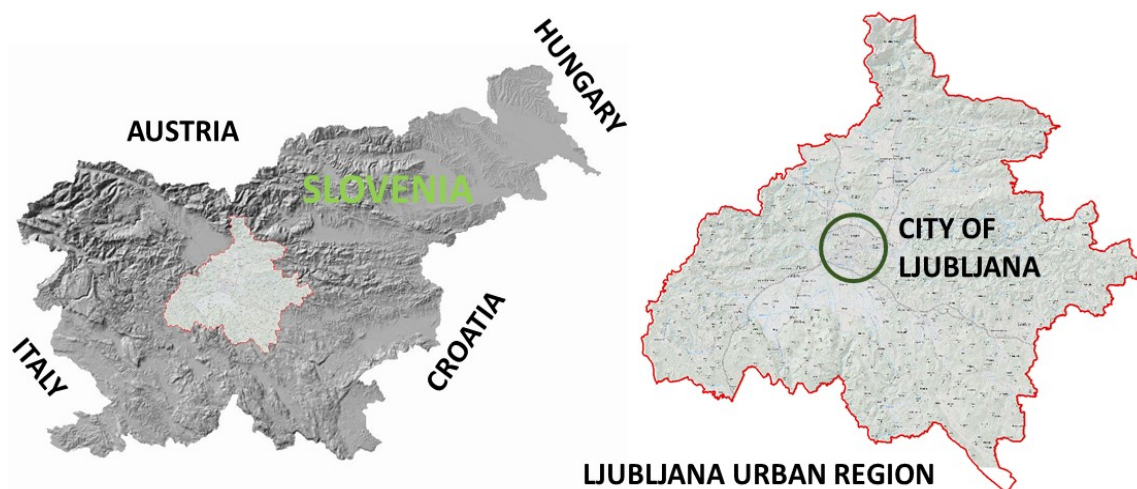
Figure 3. Ljubljana Use Case Area.

The Slovenian use case will rely on existing platforms based on NUKLEUS tool developed by LUZ, incorporating modelling and monitoring data of the LUR, such as Rivers Data (location, Flow Rate, Water Level), Soil Data, Underground Water Level Data, Slope Data, Data of urban water distribution systems—water utility networks (Capacity, Age, Location), Meteorological Data, Urban Land Use Data (current, predicted). Some of the developed platforms are open to public and some are used only by municipality of Ljubljana and their public utility companies. In the context of the Slovenian pilot, the Water4Cities will be interconnected with the existing Nukleus GIS systems used for water monitoring and urban planning. In this line, Water4Cities will provide added value capabilities to the current tools, by developing new decision support services for the identification and analysis of possible NBSs and related costs and benefits, the maintenance of water infrastructure and the empowerment of citizens through crowdsourcing capabilities.